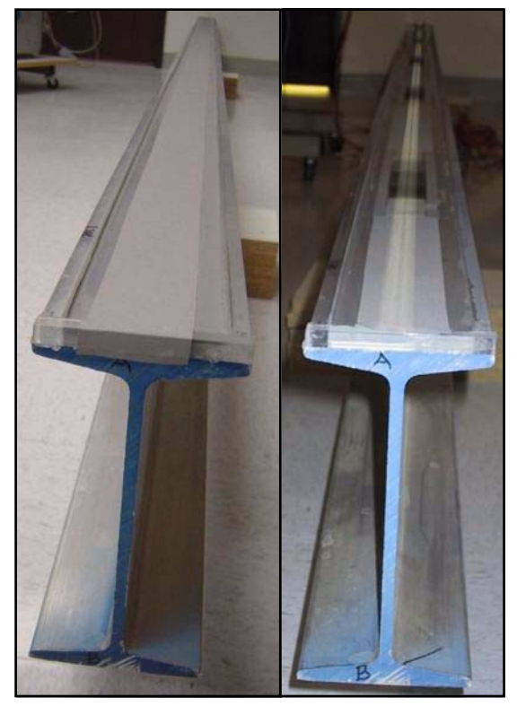
Figure 7. Calibration beam.

Two views of the completed calibration beam are shown in Figure 7. The photo on the left is with normal lighting. The photo on the right was made when strips of paper with a gray scale pattern were placed periodically to test response to changes in reflectance and while the scanner was operating. The 810nm laser beam is clearly imaged by the typical digital camera CCD sensor. In operation some type of beam viewing system should be employed to assure that the scanner is operating along the centerline of the beam.