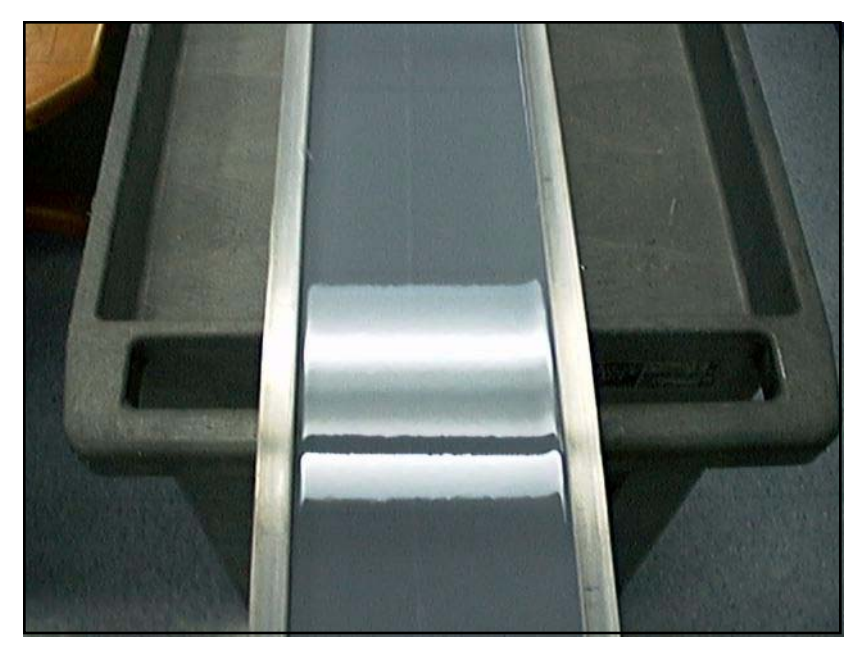
Figure 5. Finished shinny epoxy surface on calibration beam reflecting the overhead florescent lighting fixture.

epoxy gently to avoid the introduction of entrained bubbles. A paint mixing propeller driven with a variable speed drill was employed. It was found that it was impossible to break the few small (<0.05 inches) bubbles that were present. A pin point was used to tease the bubbles to the edge of the epoxy where they would no affect the finished surface.