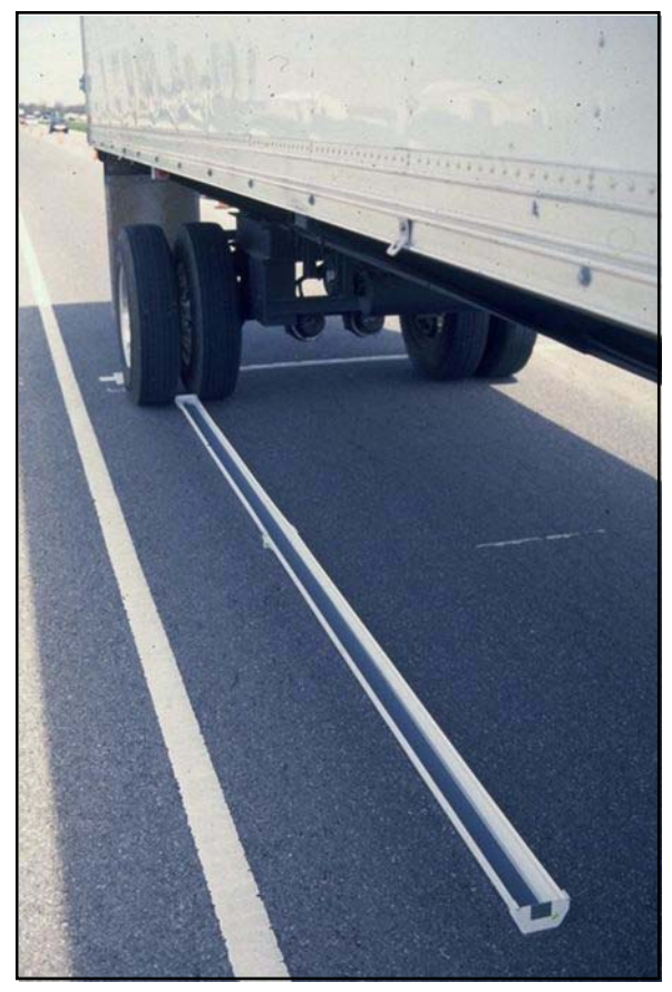
Figure 3. Water trough calibration surface under RWD trailer.

In the field, it was found that the stability of the setup was readily affected by forces of wind and inadvertent bumping or tripping. Also great care had to be exercised to avoid getting dirt or water onto the surface of the mylar. Also the PVC is flexible and the trough had to be shimmed at several points to deal with the uneven surface of the underlying pavement.