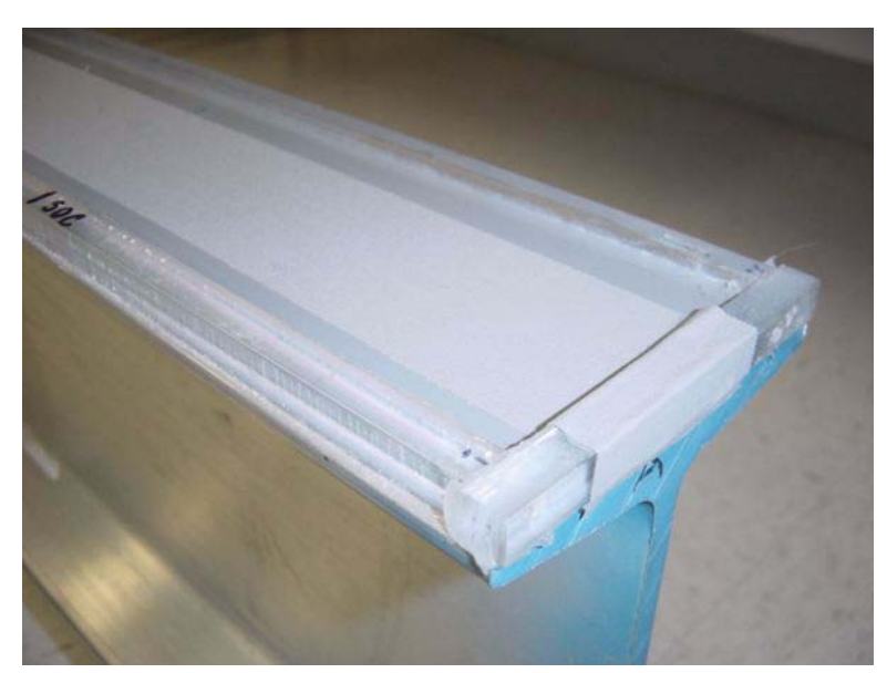
Figure 6. Tape covering epoxy on calibration beam.

8. The epoxy was specified with a gray pigment to try to match the reflectivity of pavement, however the surface was too reflective. A specialty gray duct tape (3M Highland #6910) used typically by movie gaffers to prevent unwanted reflections on movie sets was selected to cover over the epoxy. The tape shown in Figure 6, is applied as a continuous strip along the surface of the beam. The surface has reflectivity and scattering properties that are similar to inservice AC pavement. Tape products in general have a very uniform